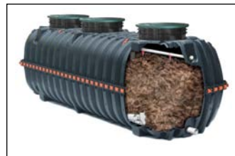
IM Series Mod Option