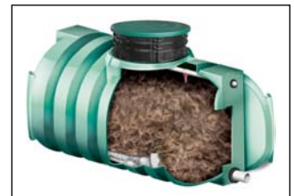
NS Series Mod Option