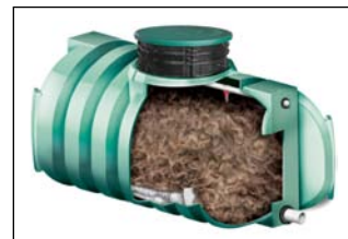
NS Series Mod Option