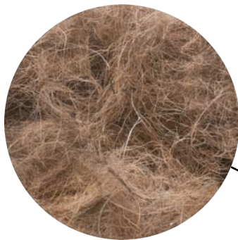
Coconut Fiber Media

Once sprayed, the effluent moves via gravity down through the media where natural microbiological processes occur that provide high level treatment. After passing through the full depth of media, the effluent travels to the bottom of the mod and the flow is split with 80% back into the treatment stream and 20% to the final dispersal point. The final treated effluent meets the requirements of NSF/ANSI Standard 40, Class 1.