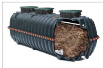
IM Series Mod Option