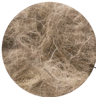
Coconut Fiber Media

Once sprayed, the effluent moves via gravity down through the media where natural microbiological processes occur that provide high level treatment. After passing through the full depth of media, the effluent travels to the bottom of the pod and the flow is split with 80% back into the treatment stream and 20% to the final dispersal point. The final treated effluent meets the requirements for TL-3