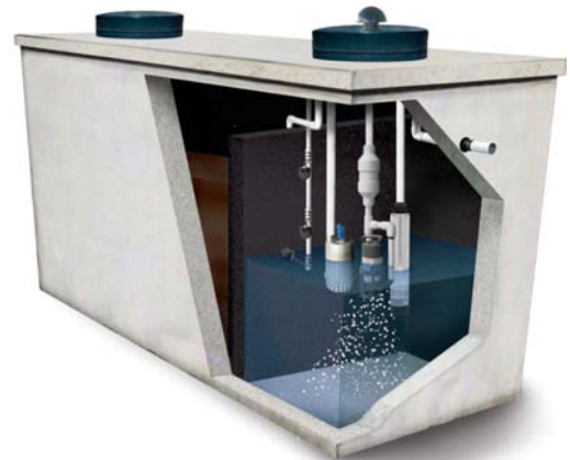
Kit in locally supplied tank