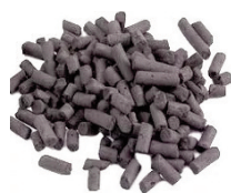
AiraCarb-HC carbon media