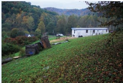
Typical ridges and valleys in the Left Fork Watershed