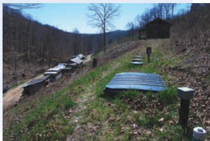
Typical narrow hollows present multiple problems for appropriately siting systems